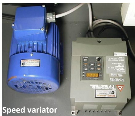
Rotation speed in V